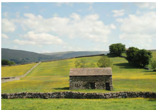
Barn at Gayle