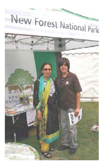
Promoting the New Forest at Southampton Mela