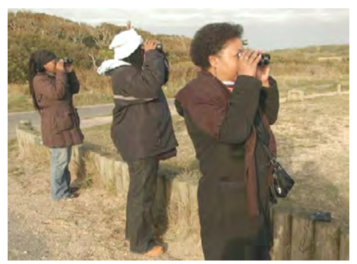
Bird-watching at Lepe Country Park