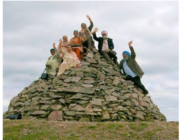
Bristol Indian Association on Dunkery Beacon

One reason Exmoor National Park is so remote is that there is no train service to Exmoor, but if you're visiting for the weekend why not use the steam train from Taunton into Minehead and pick up a bus service into the National Park?