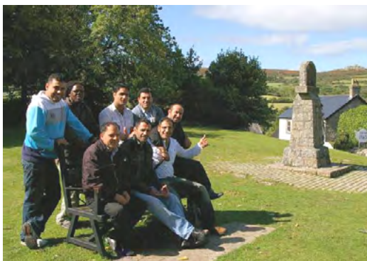
Kurdish Exiles Group at Widecombe